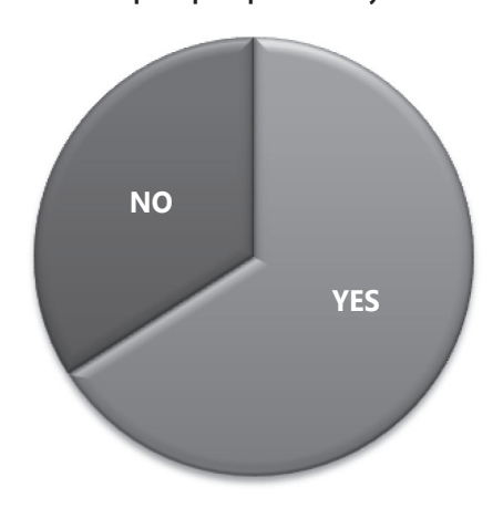
Fig. 3. Receiving information by the convicted on forms of support and the scope of post-penitentiary assistance