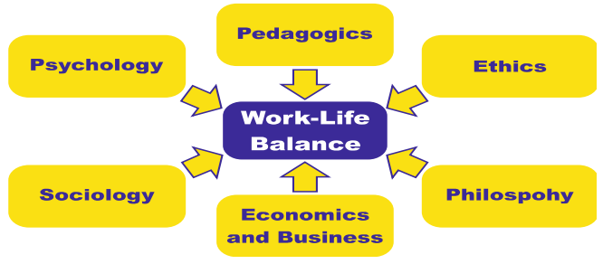
Fig. 2. Interdisciplinary issues of work – non-work life balance

The following figure shows selected sciences which are the strongest related to the analyzed issue.